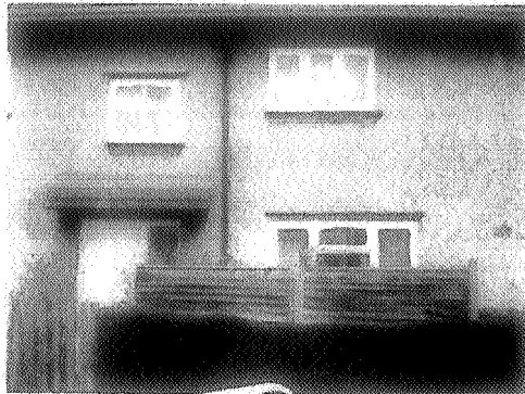
WALKERN ROAD OUTSIDE BARCLAYS SCHOOL GATSE

These are the nearest 3 properties to Barclay School. My house is on the right notice the fence erected in my front garden to stop things being thrown at my windows